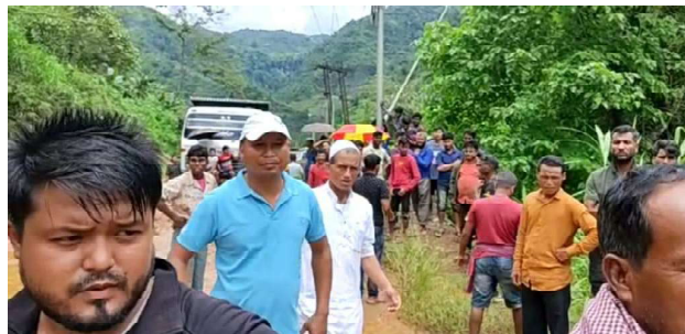
Stranded passengers near Keiphundai in NH 37.